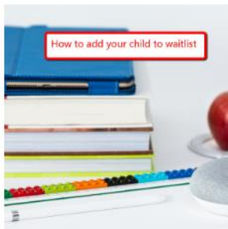
How to add your child to waitlist.